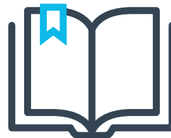
Resources to record your blood glucose and insulin